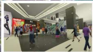
SOHO COMMERCIAL PODIUM